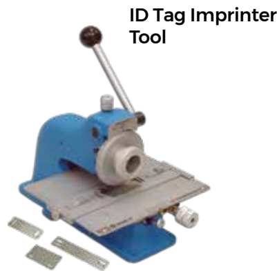
ID Tag Imprinter Tool