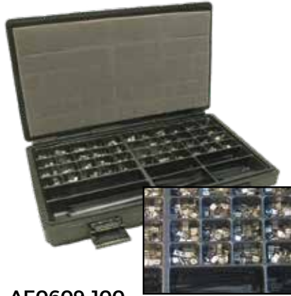
AE0609-100 Easy Read Kit

The kit comes in a convenient carrying case weighing 19.5 lbs and contains 100 of each character and carriers.