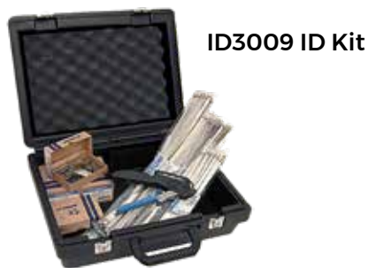
ID3009 ID Kit