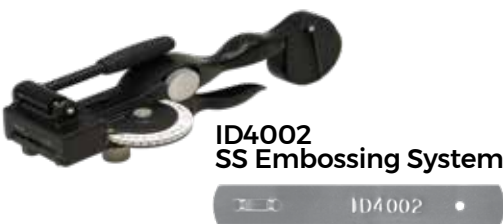
ID4002 SS Embossing System